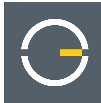
Negative brand mark